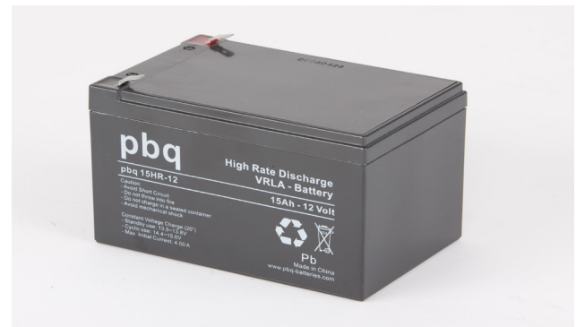
pbq 15HR-12 High Rate Discharge version of the popular 12Ah VRLA battery. Electric bikes, scooters and UPS systems run 25% longer compared to a standard 12Ah.