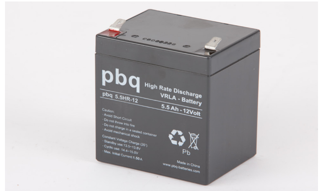
pbq 5.5HR-12 Ideal substitute for wet starter batteries in scooters. Also frequently used for robotics and other high current applications.